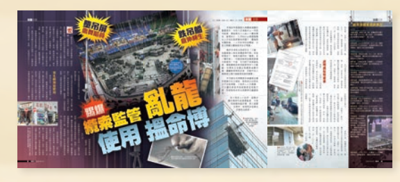
Bronze Award: East Week 銅獎:《東周刊》 Topic主題: