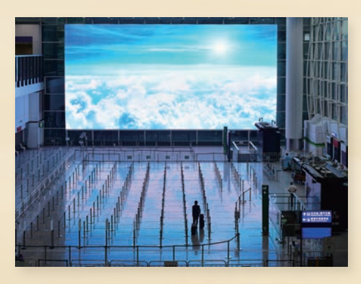
1<sup>st</sup> Round-up: Sing Tao Daily 亞軍:《星島日報》