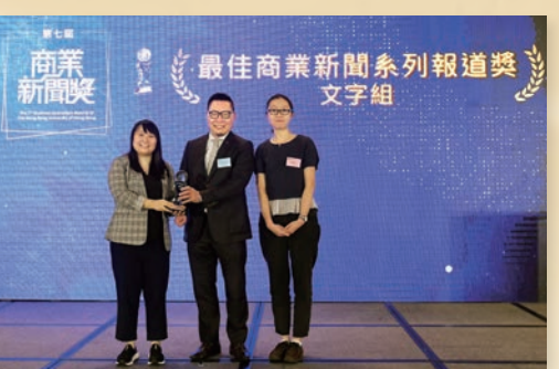
Silver Award: Sing Tao Daily 銀獎:《星島日報》 Topic主題: